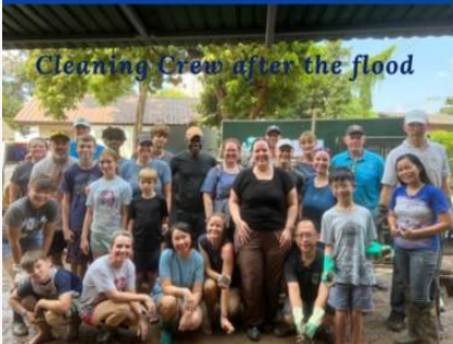
Cleaning Crew after the flood