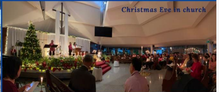
Christmas Eve in church